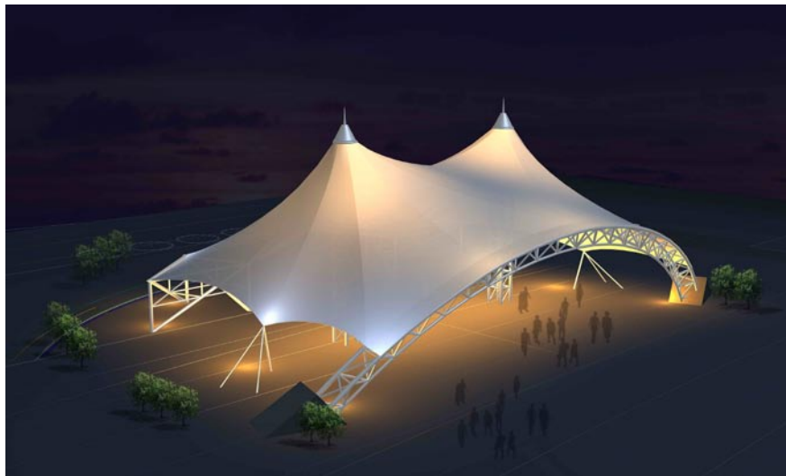
Greenland Expo Square 世博绿地广场

"Greenland Expo Square" is the largest outdoor facility of the Expo Shanghai with a total area of 25,000 square meters. This includes an audience area of 10,000 square meters, advanced lighting and audio technologies, beautiful scenery, bringing the audience to enjoy a perfect audio-visual performance.